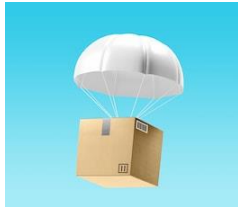
↙ Parachute mail drop

Brief: The team is now far away from home. It has been a long and difficult journey so far and morale is at an all-time low. Messages from home would really boost the struggling explorers. They're hoping that a mail drop will arrive any day!