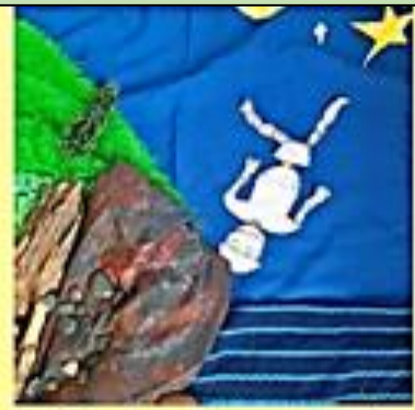
Falling head over heels.