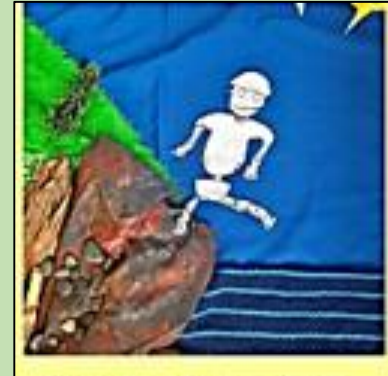
Steps off the cliff.