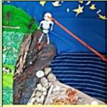
Searching the sea.