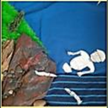
Legs break off.