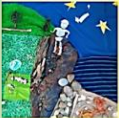
Standing on the cliff.