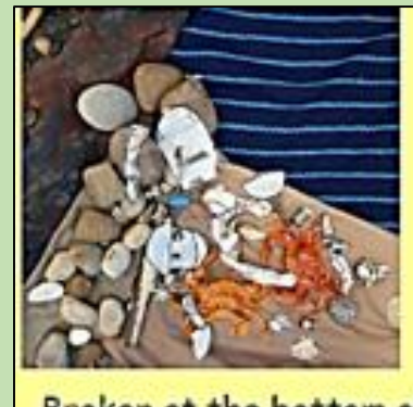
Broken at the bottom of the cliff.