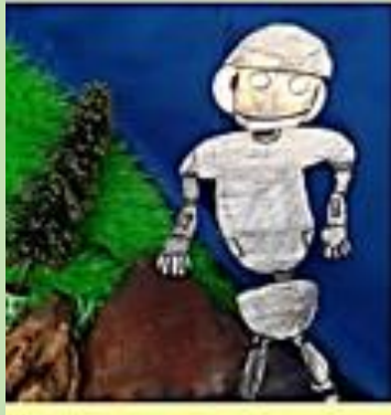
Eyes turn white.