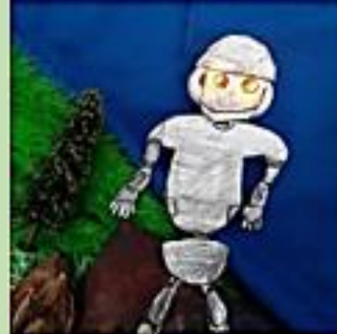
Eyes turn red.