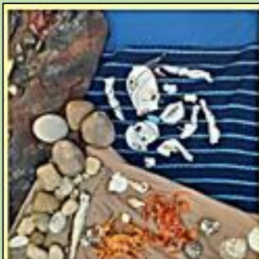
More parts break off.