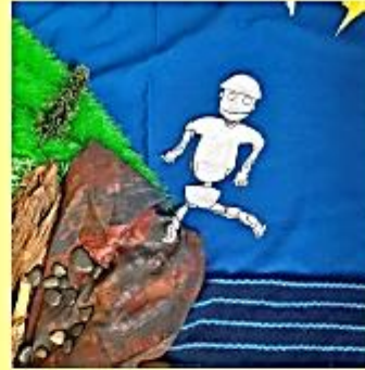
Steps off the cliff.