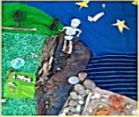
Standing on the cliff.

The Iron Man clanked his way to the _____