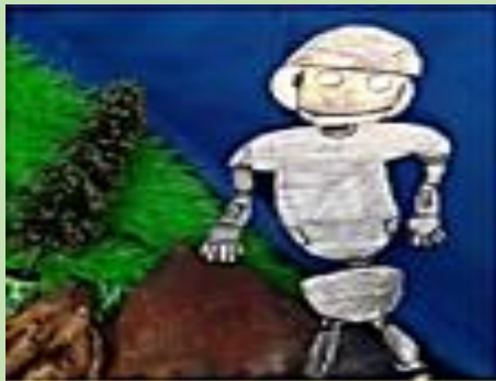
Eyes turn white.

His great iron head turned _____. His great iron ear turned _____.