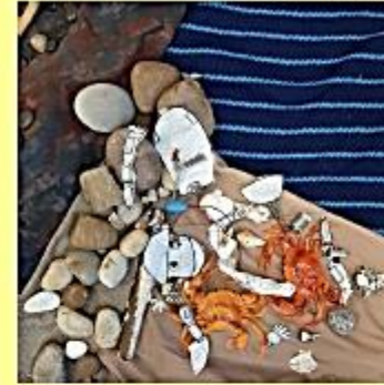
Broken at the bottom of the cliff.