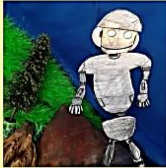
Eyes turn white.