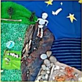
Standing on the cliff.