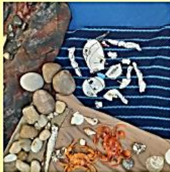
More parts break off.