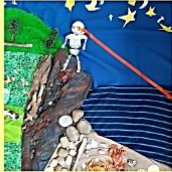
Searching the sea.