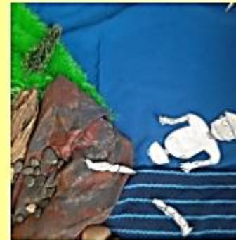
Legs break off.