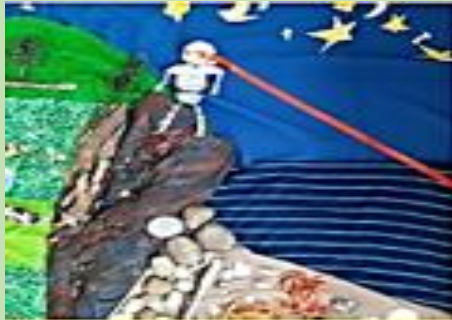
Searching the sea.

Where had he come from? Nobody knew. _____