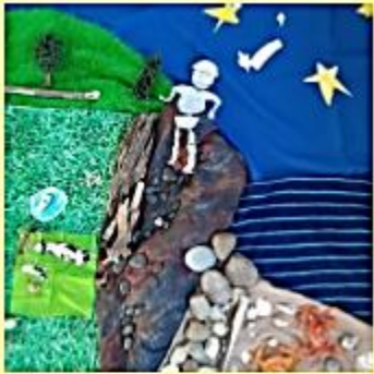
Standing on the cliff.