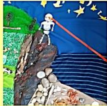
Searching the sea.