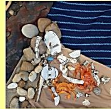
Broken at the bottom of the cliff.