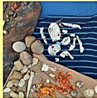
More parts break off.