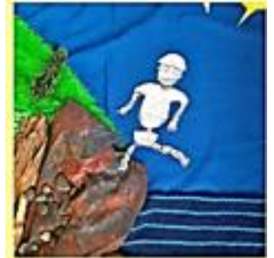
Steps off the cliff.

Now, have a go at writing your own version.