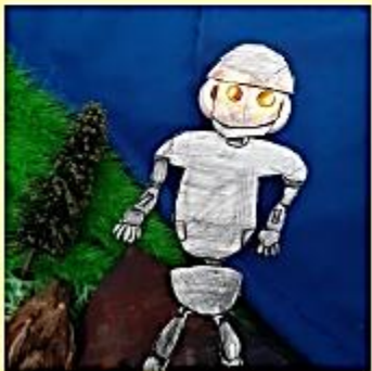
Eyes turn red.