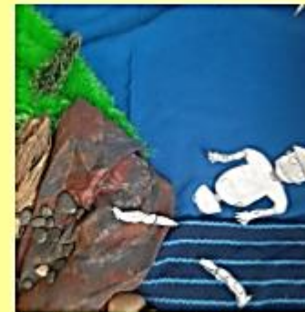
Legs break off.