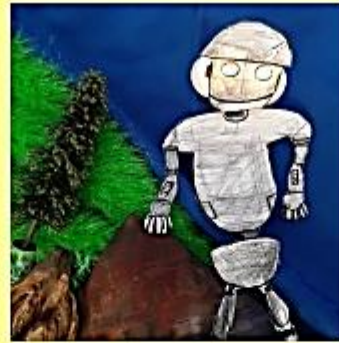
Eyes turn white.