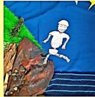
Steps off the cliff.