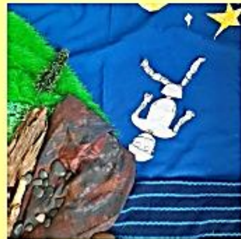
Falling head over heels.