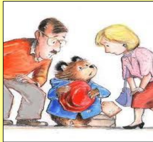
"I told you so!"