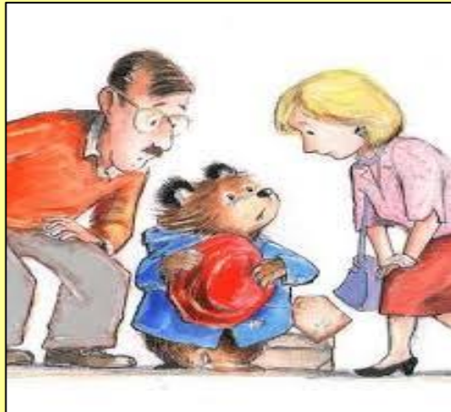
"I told you so!"