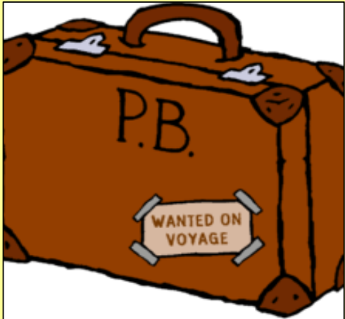
Wanted on Voyage.