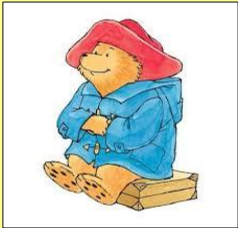
It sat on a suitcase.