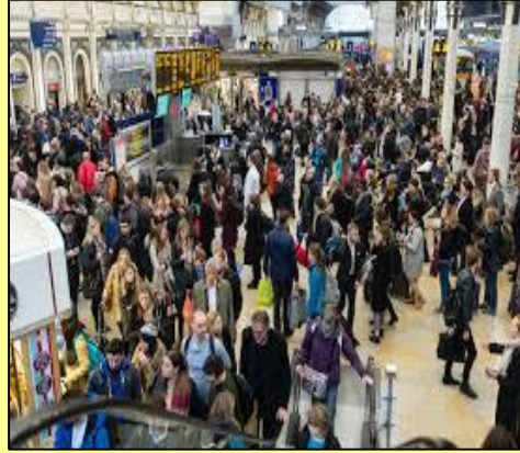
The station was crowded.