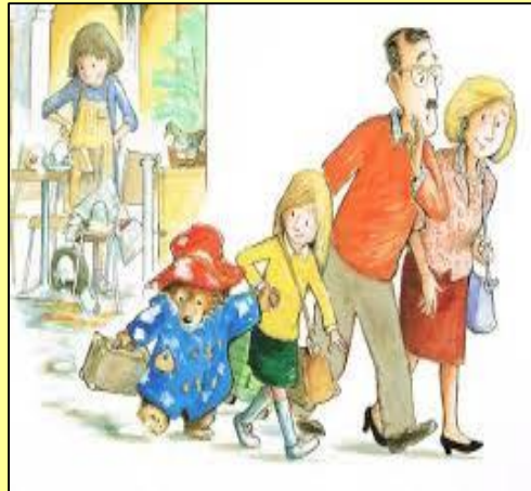
They all went home.