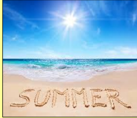
It was a warm summer day .