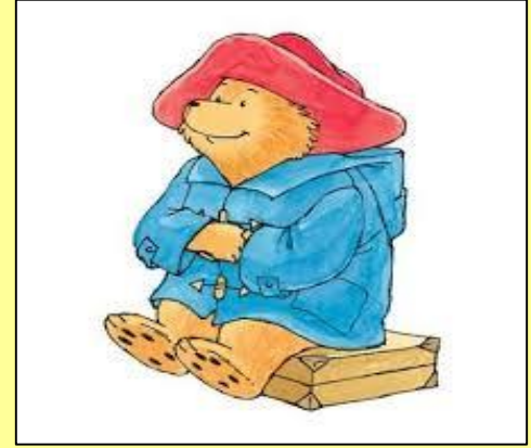
It sat on a suitcase.