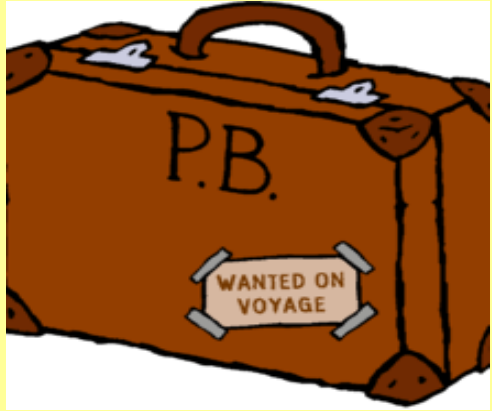
Wanted on Voyage.

Sequencing - Here are some pictures that represent different parts of the story. Can you put them back in to the correct order?