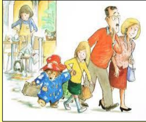
They all went home.