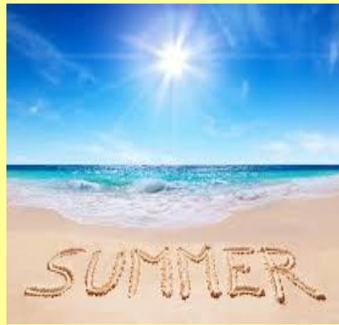
It was a warm summer day .