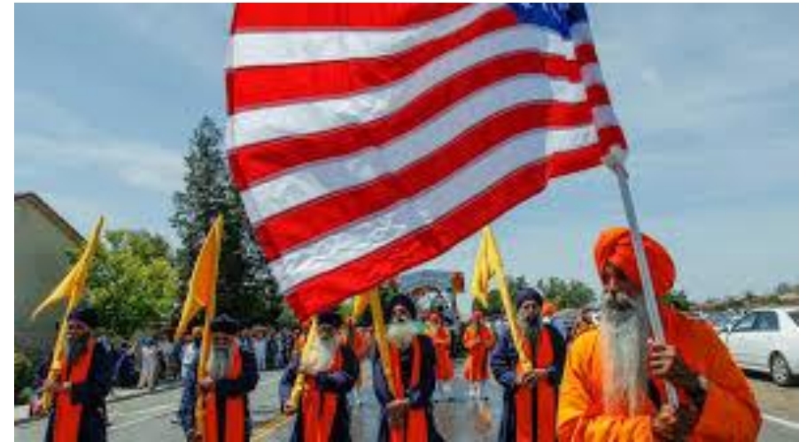
Sikhs in America

Even though their lives may be completely different in nearly every way, these people are connected because they share the same beliefs.