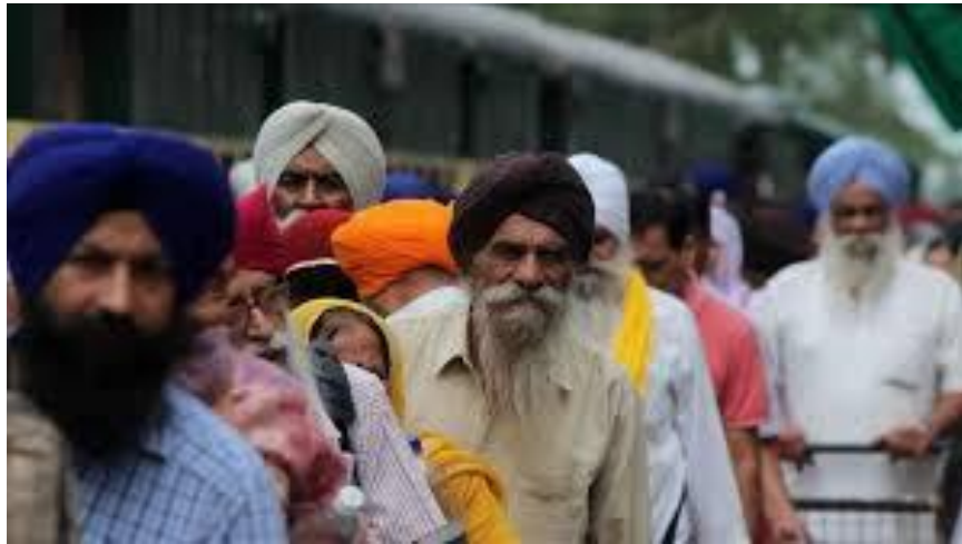
Sikhs in India

That means that there are Muslims, Christians, Buddhists etc in all parts of the world. Even if these people have nothing else in common, they are connected by their beliefs.