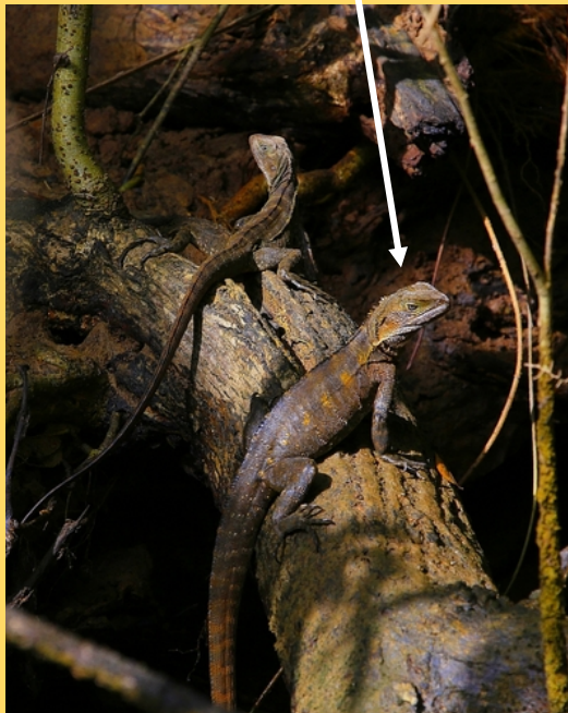
Eastern Water Dragons