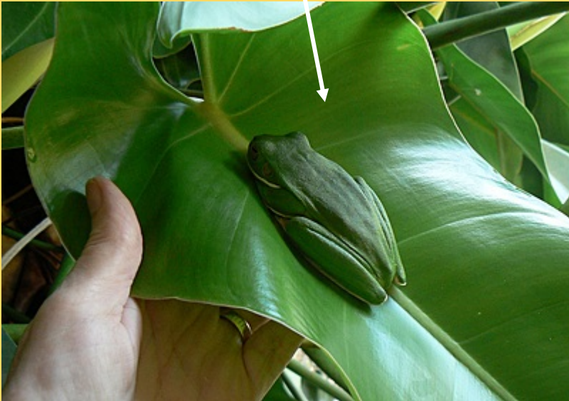
Giant White Lipped Tree Frog