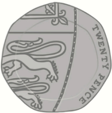
20p Twenty Pence