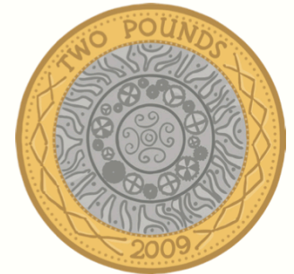
£2 Two Pounds