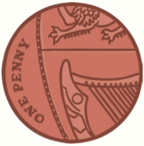
1p One Penny

In Maths this week, we are looking at money. When looking at money we look at value rather than number of coins. These are the coins we have in this country.