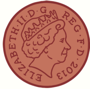
2p Two Pence