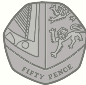
50p Fifty Pence