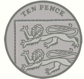
10p Ten Pence