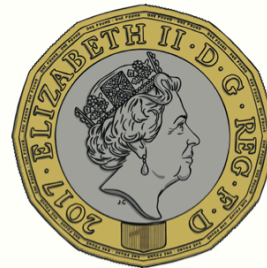
£1 One Pound