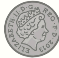
5p Five Pence